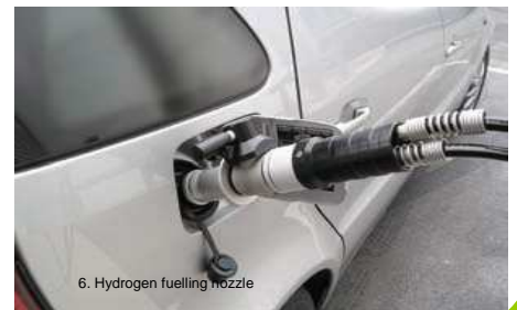
6. Hydrogen fuelling nozzle

The use of local tidal lagoons and pumped storage schemes to store energy