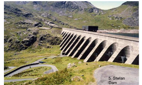
5. Stwlan Dam

Examine the potential of off-grid technologies and industries to use or store the energy produced e.g. data centres