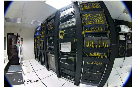
4. Data Centre

Examine the potential of off-grid technologies and industries to use or store the energy produced e.g. data centres