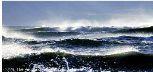
1. The Pentland Firth

The Pentland Firth and surrounding area contain 6 of the top 10 sites in the UK for tidal development. The area has the potential to deliver 700MW of tidal energy by 2020 with estimates that this could actually be 30 times more.